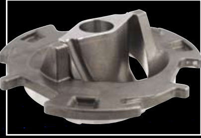
SEG Cutter System

In addition, the SEG AUTOADAPT range of pumps can remove industrial wastewater containing fibres in industrial applications.